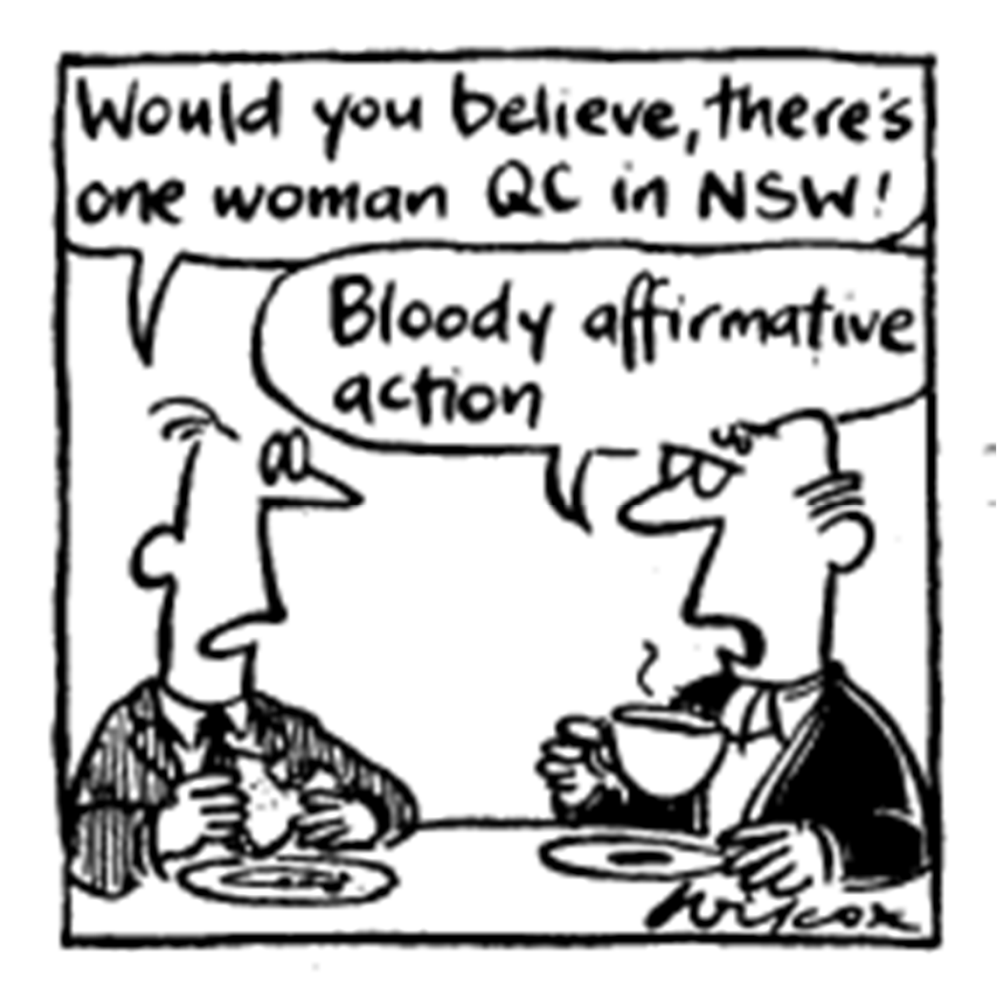
'QC Pleads for Justice for Women Lawyers' Sydney Morning Herald, 31 March 1994