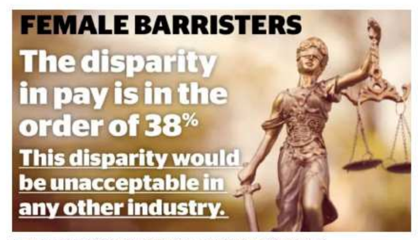
Source: Equitable Briefing Working Group report, 2015.

Now the NSW Bar Association is proposing national targets and reporting requirements to tackle 'head-on' the lack of gender diversity at the bar and create a level playing-field for men and women.